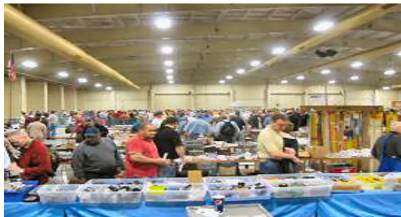
2011 SOLD-OUT Charlotte Hamfest™ SwapFest Area

In 2010 and 2011, our entire SwapFest area, of 324 flea market tables, was ‘sold-out’ on Saturday morning of the hamfest. We expect to have another SwapFest ‘sell-out’ again in 2012. Spark your new business year, by being at our 2012 Charlotte Hamfest™.