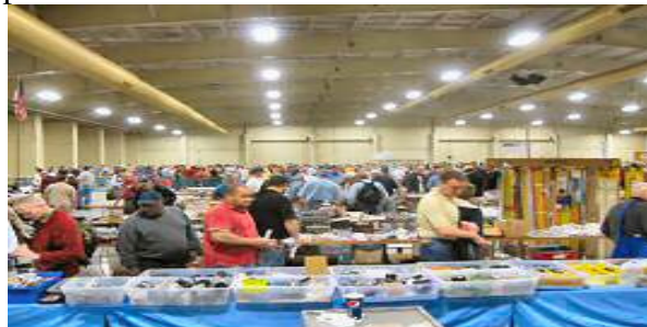
Charlotte Hamfest™ SwapFest Area - SOLD OUT in 2010 & 2011!

In 2010, and again in 2011, our entire SwapFest (flea market) area was 'sold-out' before the Saturday morning opening of the hamfest. We have only 324 tables available, and in 2012 we expect to have another SwapFest 'sell-out'. With only 324 SwapFest tables available, get your table order in early . Don't be left out in the winter cold by delaying your order until its too late☺ Add 'SPARK' to your 2012, by being at our 2012 Charlotte Hamfest™ SwapFest.