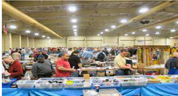
2011 SOLD-OUT Charlotte Hamfest™ SwapFest Area

If on-site camping is your thing, there are plenty of full-service camping spaces available at the Cabarrus Arena and Events Center. As a courtesy, we have enclosed a Camping Reservation Form. It must be mailed/faxed directly back to the Arena to avoid any delay, as the camping is handled directly by the arena folks.