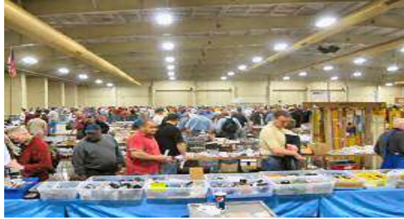
2011 SOLD-OUT Charlotte Hamfest™ SwapFest Area

If on-site camping is your thing, there are plenty of full-service camping spaces available at the Cabarrus Arena and Events Center. Go out to www.charlottehamfest.org to get the camping form.