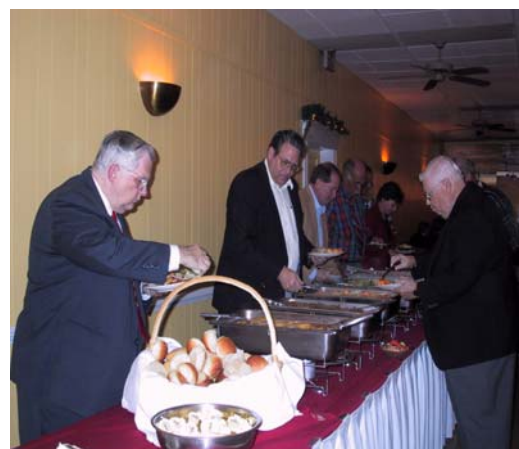
We had lots of good food!!!