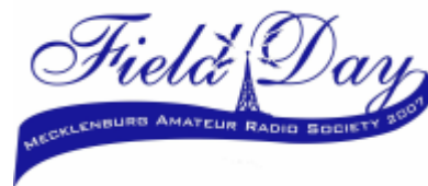
Graphic on Front of the Shirt