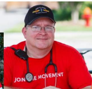
Ham Medic Volunteers