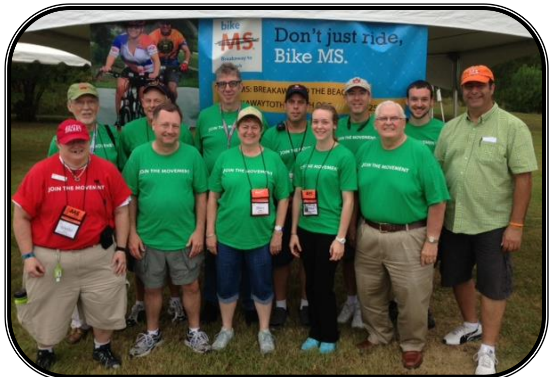
This is the group that went all the way to the end point at Sunset Beach on Sunday.

The MS Society was very pleased with the event and very much appreciated all our efforts to help make it a safe event.