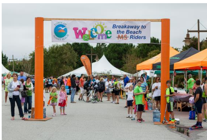
Finish Line at Sunset Beach