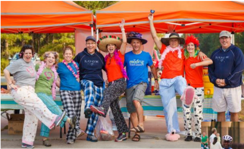
Rest Stop Volunteers