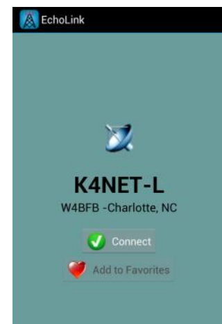
EchoLink application on a smartphone.

More info: http://www.w4bfb.org/packet.html